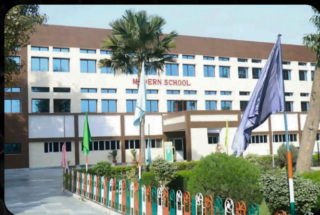
MODERN SCHOOL FARIDABAD