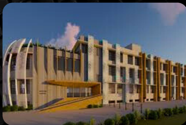
MODERN SCHOOL VAISHALI