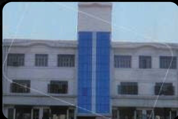
DELHI INTERNATIONAL HAPPY SCHOOL