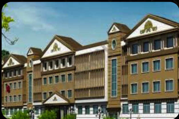
MODERN SCHOOL GREATER NOIDA