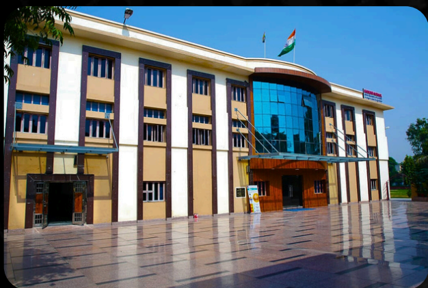
MODERN SCHOOL NOIDA SEC-11