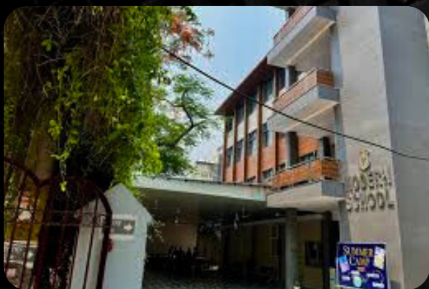
MODERN SCHOOL NOIDA SEC-12